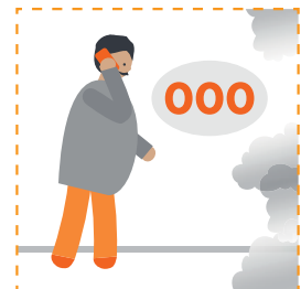
Call triple zero