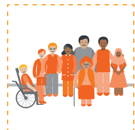
Go to the assembly area