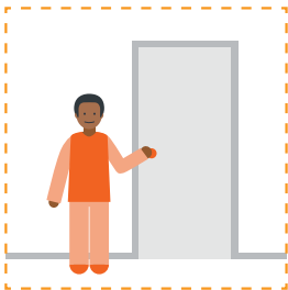
Close the door