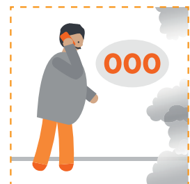
Call triple zero