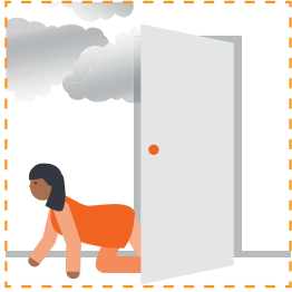
Get down low